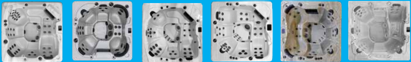
Nassau Royale Caribbean Breeze Coconut Bay Pleasure Cove Palm Island Paradise Bay