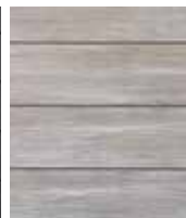
Coastal Gray Upgrade