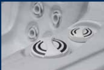
Illuminated Air Diverters