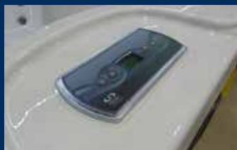
Illuminated Topsides (K506 Standard)