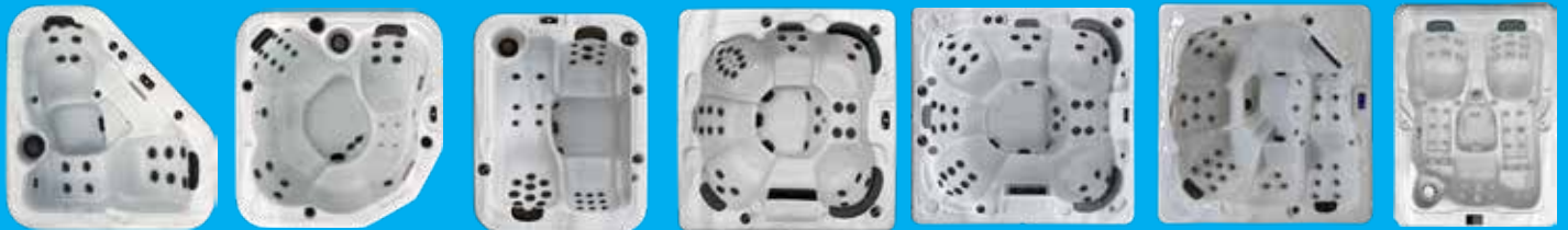
Binimi Treasure Cay Sunset Cove Tranquility Harbor Ocean Breeze Cabana Bay Twin Palms