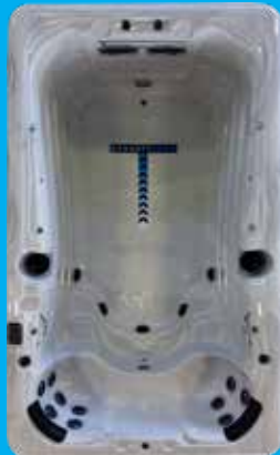
13' Aquex Pro