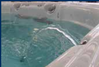
Illuminated Water Fountains