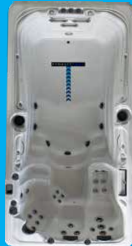
17' Aquex Pro Plus