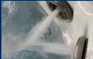
Illuminated Adjustable Jets