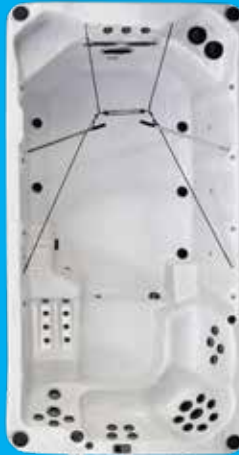
16' Aquex Trainer