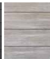
Coastal Gray Upgrade