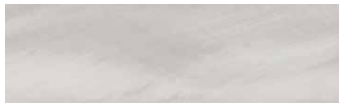
Sterling Marble - Standard