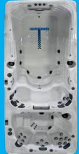
19' Aquex Dual Pro