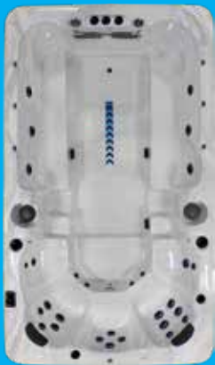
13' Aquex Party