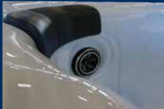
Super Soft Headrest