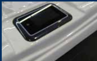
Illuminated Topside (K.1000 Standard)